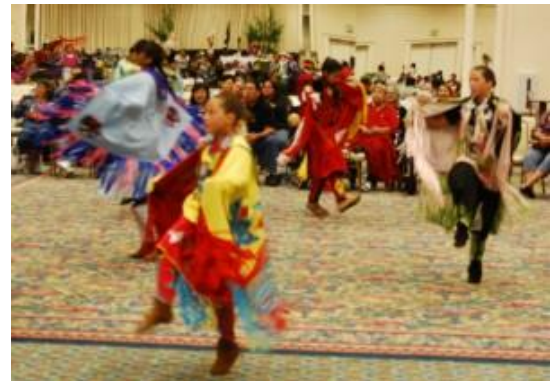
Soaring Eagles dancing the Shawl Dance.