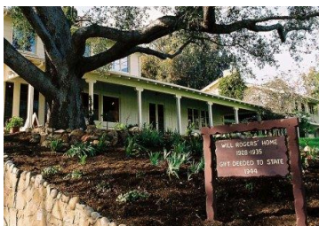
Will Rogers' Home