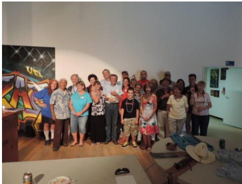
The Group Picture